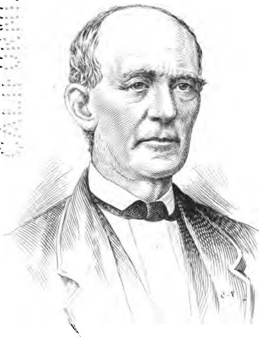
WILLIAM H. MCGUFFEY